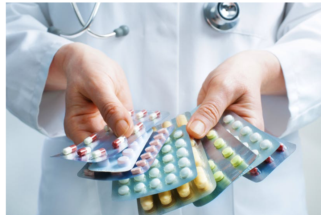
Figure 1. Label in 18pt Calibri.